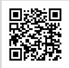
VIDEO: Why ranked choice voting is bad public policy

Here are details on the state's voter approved Top Two open primary:<sup>14</sup>